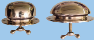
3" Style 4" & 5" Style

Manufactured in gunmetal, we produce low profile vents for the coach roof and higher patterns for areas that could become awash. The high patterns have a through deck spigot and inner neoprene seal for added water protection and all vents have a 'T' handle for opening and closing.